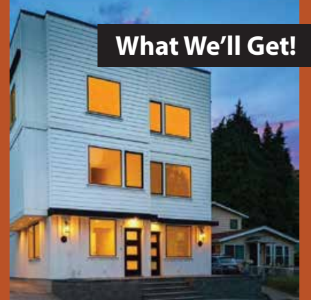
Is this the Edmonds you want for your future and the future of your children?